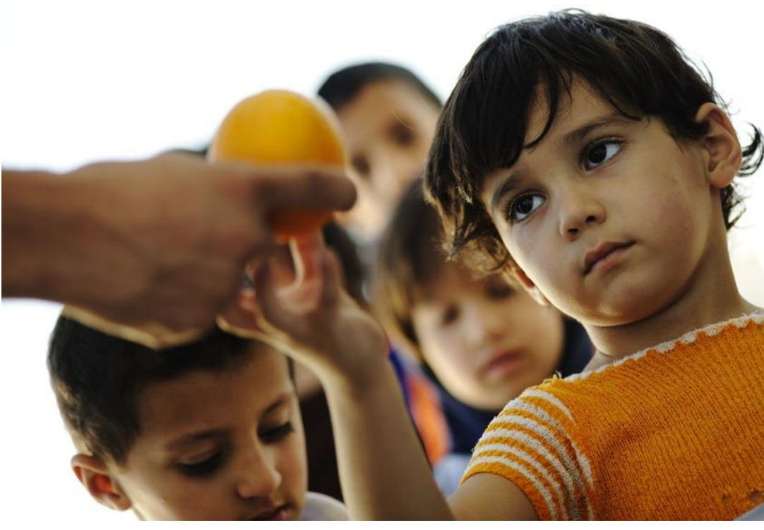
Inspired Giving. Meaningful Change.